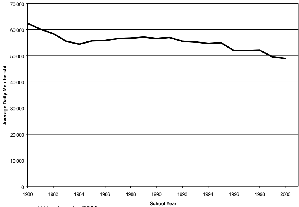
Figure C JPPSS Enrollment Trend

2001 estimate by JPPSS. Source: JPPSS Comprehensive Annual Financial Report FY2000.